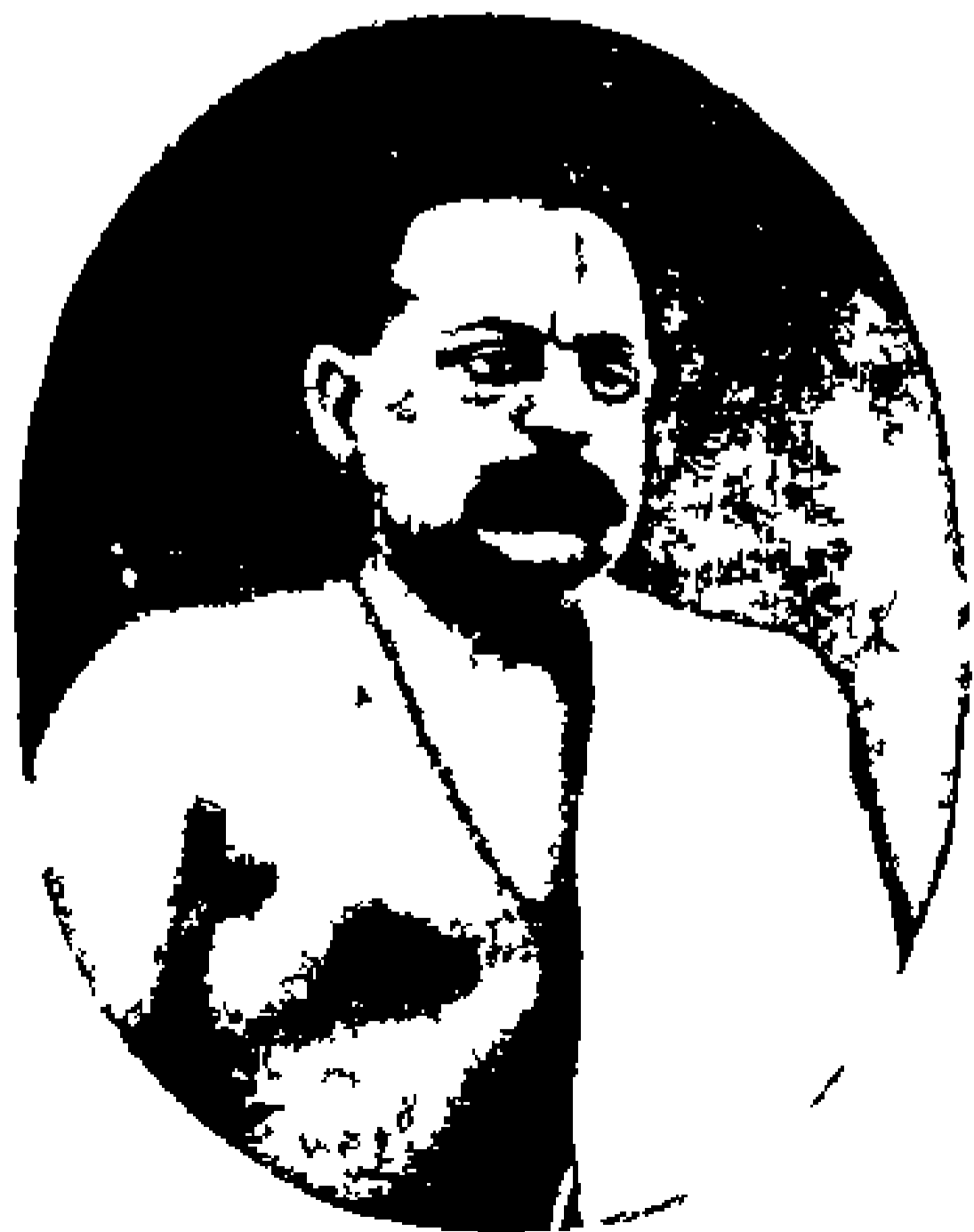
Goswami Shri Anruddhacharya See Page 347